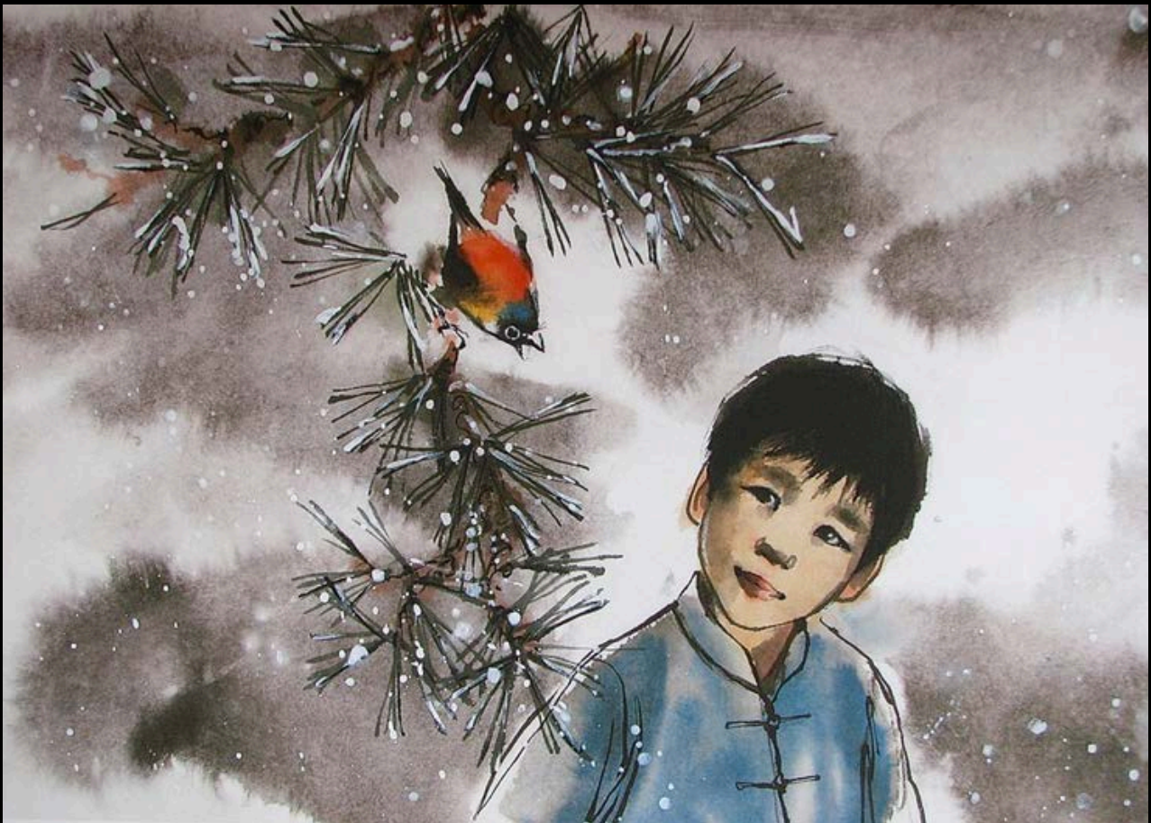
Illustration by Anne Spudvilas