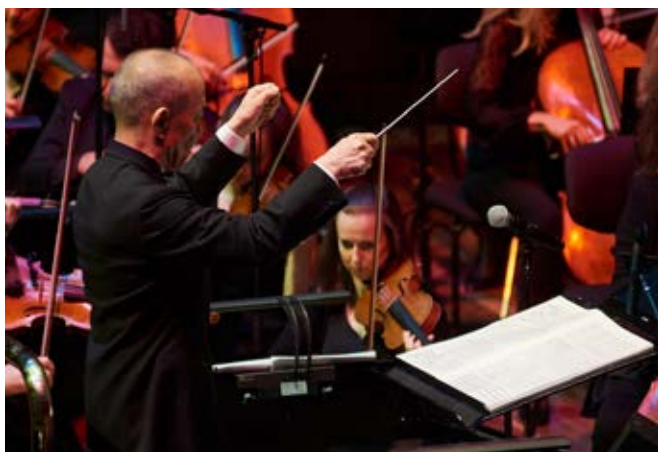
Joe Hisaishi conducts at Joe Hisaishi Symphonic Concert: Music from the Studio Ghibli Films of Hayao Miyazaki at Hamer Hall