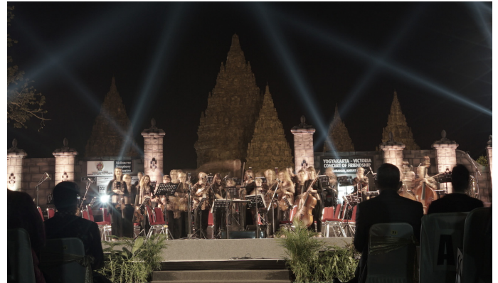
Image credit: Prambanan Temple 'Concert of Friendship', Special Region of Yogyakarta, Indonesia